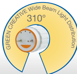
Lamp Front View

This lamp uses an innovative glass design that diffuses heat and light more evenly. As a result of its compact light engine, this lamp produces a light emitting area of 310°. This wider beam angle improves a fixture's total light distribution and creates a more complete lighting effect.