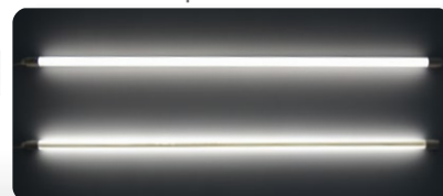
Lamp Back View