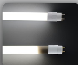
Other LED Tubes