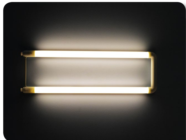
OTHER LED U-BENT